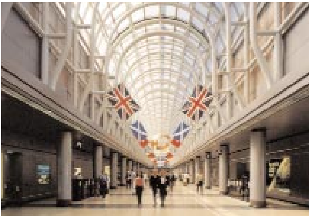
AMERICAN AIRLINES TERMINAL, O'HARE INTERNATIONAL AIRPORT Chicago, IL Architect: Ellerbe Becket Associates