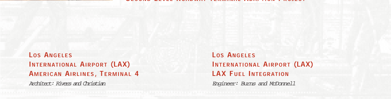
LOS ANGELES INTERNATIONAL AIRPORT (LAX) AMERICAN AIRLINES, TERMINAL 4 Architect: Rivers and Christian