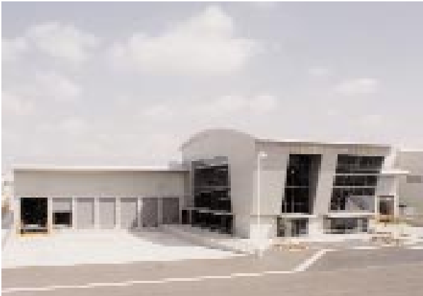
LOS ANGELES INTERNATIONAL AIRPORT (LAX) SINGAPORE AIRLINES Architect: Nadel Architects, Inc.