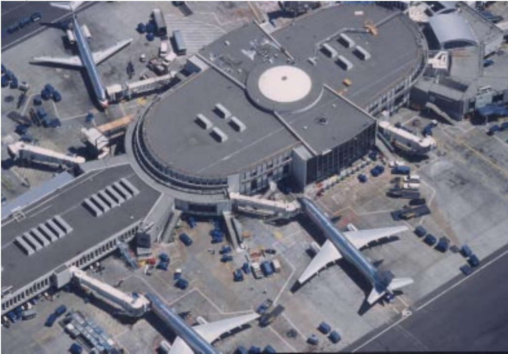
Los Angeles International Airport (LAX), American Airlines, Terminal 4 Los Angeles, CA USA