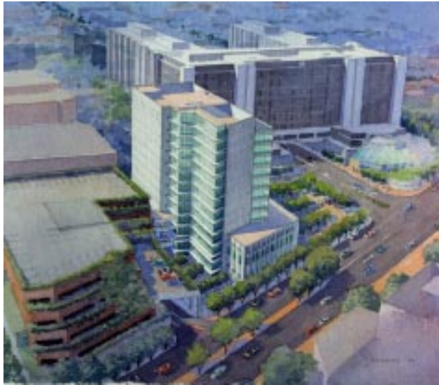
Cedars-Sinai Medical Center, Diagnostic Treatment Center Los Angeles, CA USA

New Halifax Infirmary QE II, Health Sciences Centre Saskatoon City Hospital Cedars-Sinai Medical Center Research Facility House-Ear Institute Hoag Memorial Hospital